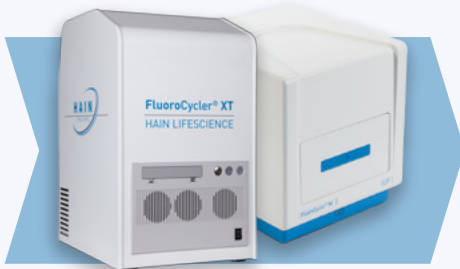
Amplification and detection