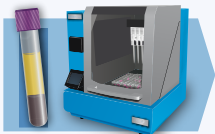
DNA extraction from EDTA plasma